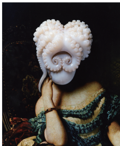
Yumiko Utsu, Octopus Portrait , from the series Out of Ark , 2009

The resulting sensation is familiarity and, at the same time, disconnection and opening. Released from their original contexts, the everyday elements present in the pictures drag us into new surreal and iconic worlds, both ambiguous and elusive, in an authentic journey through a fantastic universe, inhabited by creatures that have come out of a new Ark, Out of Ark .